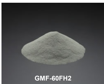
■ Grain Distribution

GMF-CVD and GMF-60FH2 are the products marking the dawn of a new age in fine particle businesses of our company. These are ultra-high-purity silicon carbide powder to suit the material for Electrical parts and Power Devices, as impurity level is very low